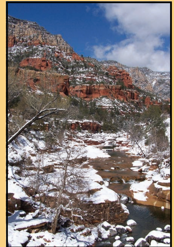
Oak Creek Canyon Sedona